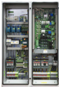
Figure 3: SmartPick minimum configuration

Only two cabinets are required for a minimum configuration supporting a single magnet with no battery backup (Figure 3:). This arrangement would be suitable for a scrap magnet application for example.