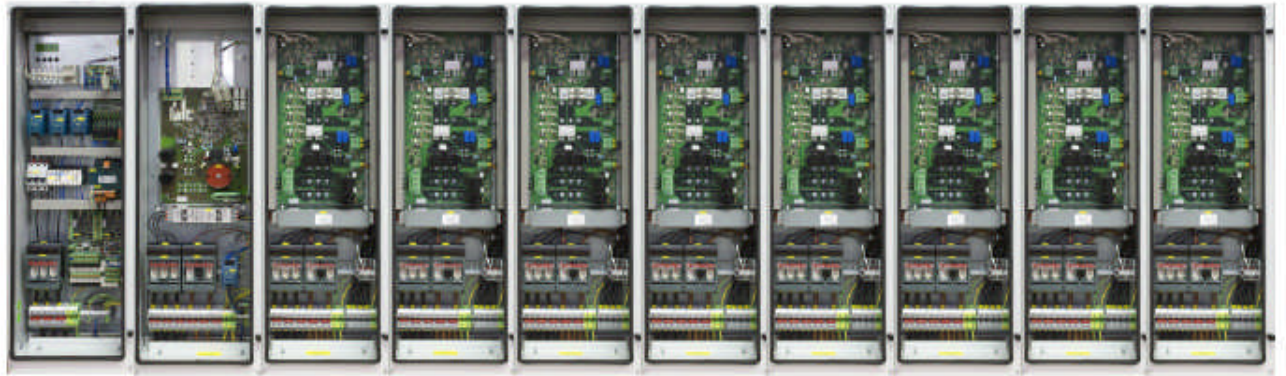
Figure 2: SmartPick maximum configuration

Modular cabinet design means the controller can be adapted to suit a wide range of applications. Figure 2: below shows a maximum configuration with battery backup and eight magnet groups: