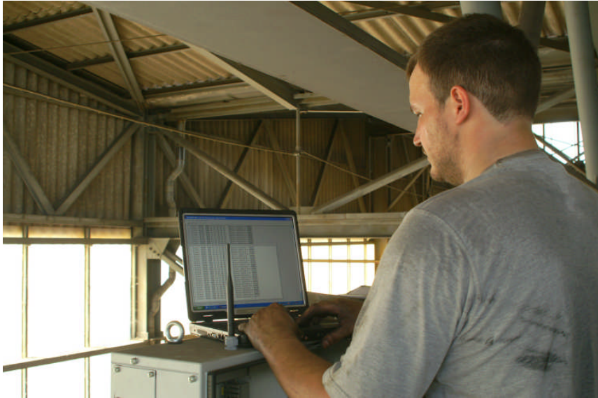
Figure 2: The magnet control system being checked by a specialist

The maintenance tasks are supported by a standardised checklist, on which the technicians record the work carried out. The test log also contains a list of any defects with a recommendation for appropriate repair.