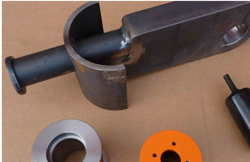
Figure 2: Spreader beam components manufactured in-house

While mechanical parts are generally not available from stock, they can be made on request. Since a lot of the parts are manufactured in-house, we can produce many mechanical components very quickly.